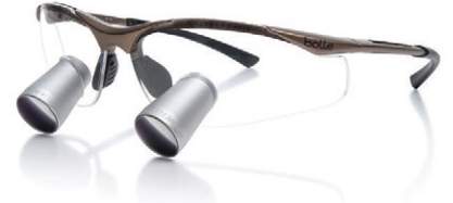
3.2x | BOLLE