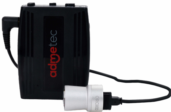
ORCHID BRIGHTER. LIGHTER. ERGONOMIC.