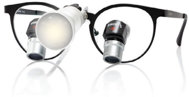
ORCHID-S / ORCHID ERGO

The ORCHID light is the first of its kind in the global market. It is remarkable for being lightweight while still providing a well-focused and shadow-free light.