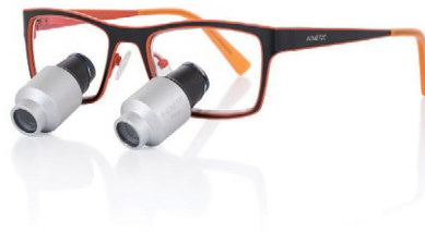
4.0x | JAZZ