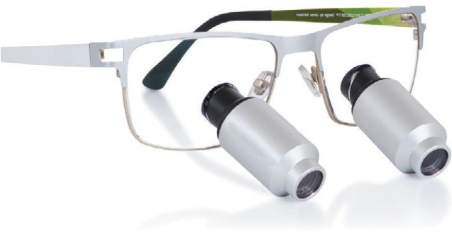
5.5x | MORRIZ OF SWEDEN (wide)