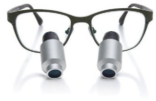
4.8x | MORRIZ OF SWEDEN

Admetec Prismatic loupes are ideal for surgeons who require higher magnification for critical surgical procedures.