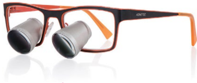
2.5x | JAZZ

High quality Galilean binoculars installed into the loupes are extremely close to the eye and therefore provide a wide field of vision.