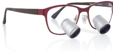
2.7x | MORRIZ OF SWEDEN