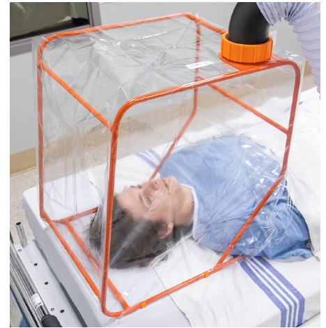
Aerosol Containment Tent (ACT)