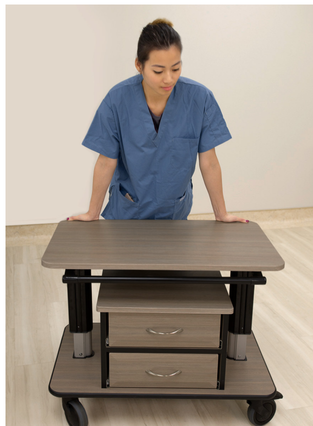
Achieve Your Perfect Working Height