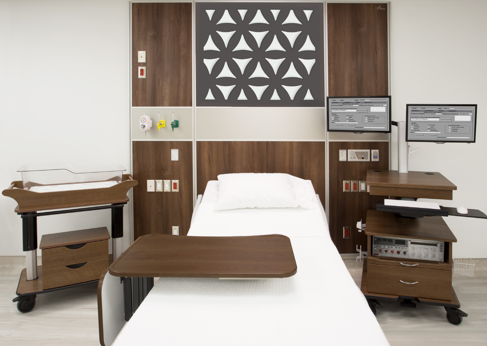
Matching Finishes for that "Hotel Feel"