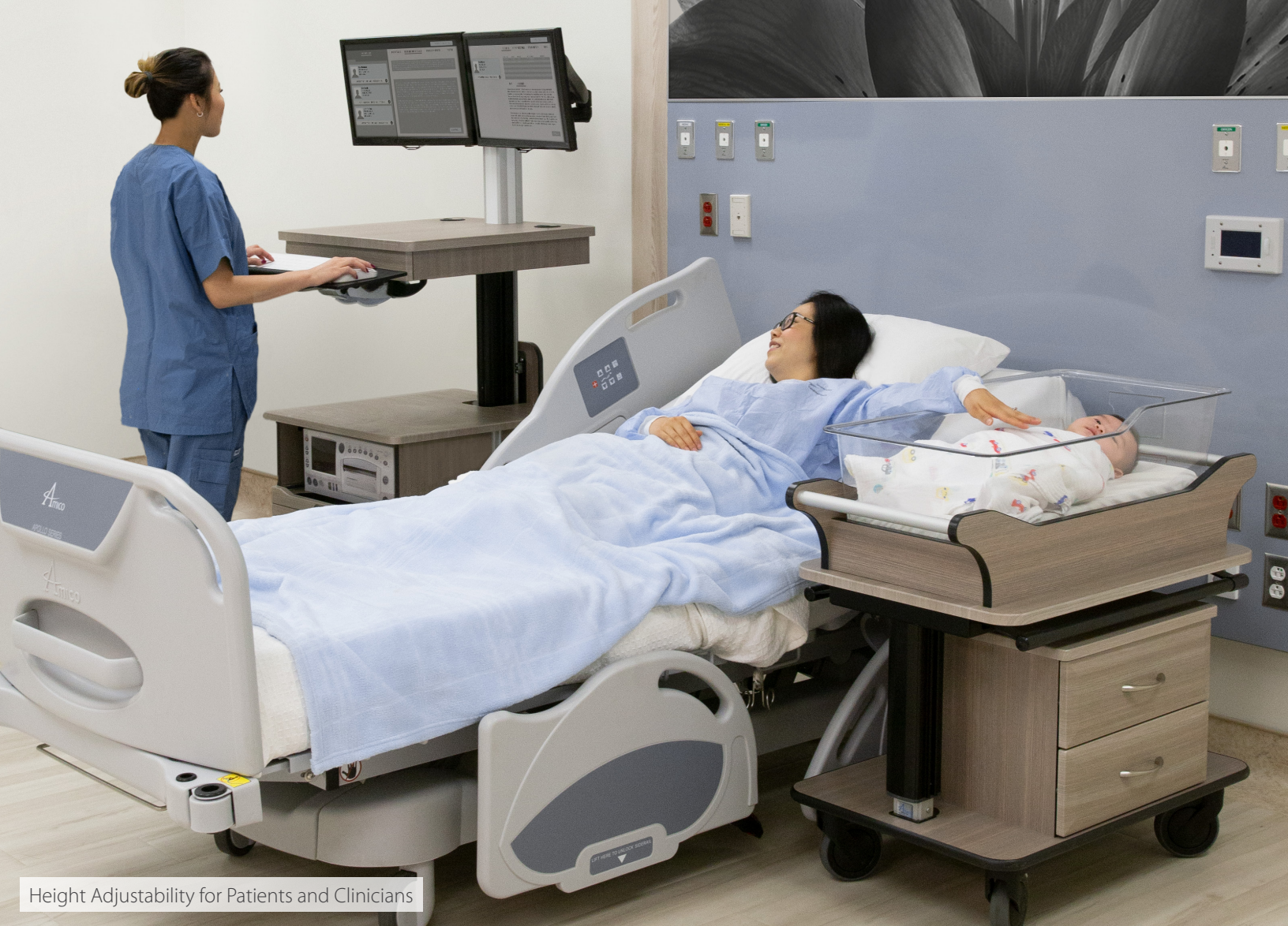
Height Adjustability for Patients and Clinicians