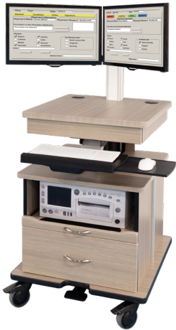
Fetal Monitor Carts

Amico understands that the moment of Labor and Delivery can be stressful. When time is tight, the clinical team needs to be in the best position to care. To help, we created the first series of height adjustable labor and delivery equipment in the market. Our Sit-to-Stand fetal monitor cart allows the nurse to work seated or standing. The height adjustable delivery cart allows for unprecedented nurse and doctor access to really fit into your labor situation. Our fully height adjustable bassinet is not only great for nurse ergonomics, but allows Mom to get close to the baby while in bed, keeping the mother/baby interaction safe and comfortable.