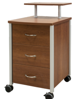
Lucas Series (Laminate or Thermofoil)