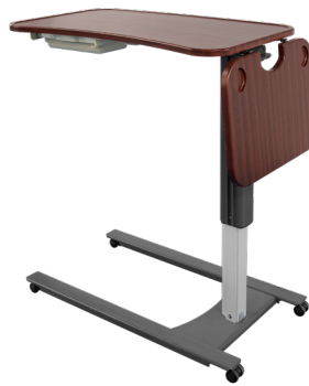
Flip Kidney Table