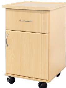
Oliver Series (Thermofoil)