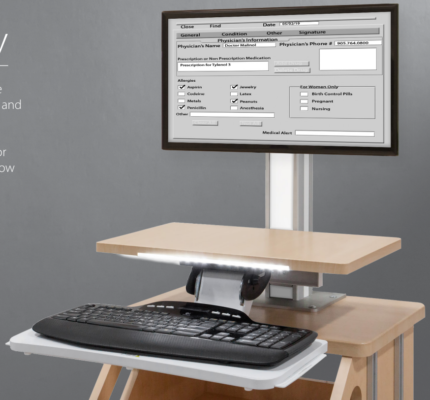
Touchpad Light for Night-time Charting

Whether it be a custom color, dimension, or design, we want to work with you to design the product that is uniquely for you.