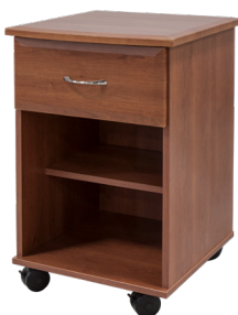
Jasper Series (Laminate)

Amico's bedside cabinets feature contemporary designs and durable construction to meet the demanding needs of today's healthcare environment. Manufactured using seamless thermofoil and high-pressure laminate, these cabinets come with various hardware and drawer front styles to choose from. With different drawer configurations and optional features including casters, drawer liners or spill guard tops, our Bedside Cabinets can be customized to suit any existing décor.