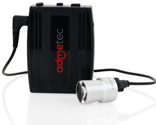
ORCHID / ORCHID-F BRIGHTER. LIGHTER. ERGONOMIC.