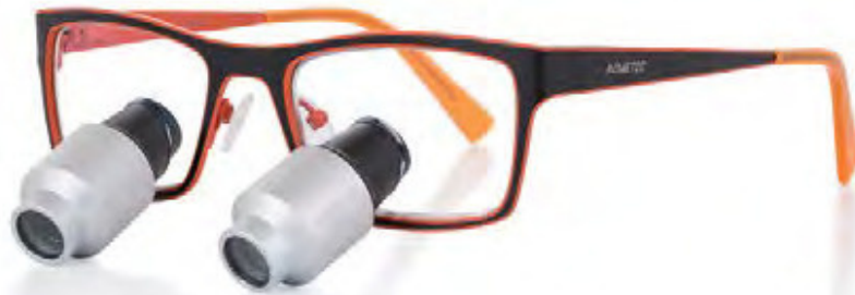
4.0x | JAZZ

Admetec Prismatic loupes are ideal for surgeons who require higher magnification for critical surgical procedures.