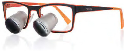
2.5x | JAZZ

High quality Galilean binoculars installed into the loupes are extremely close to the eye and therefore provide a wide field of vision.