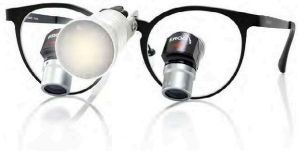
ORCHID-S / ORCHID ERGO

The ORCHID light is the first of its kind in the global market. It is remarkable for being lightweight while still providing a clear, shadow-free light.