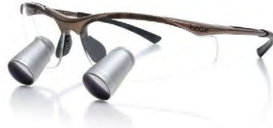
3.2x | BOLLE