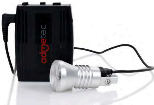
ORCHID / ORCHID-E BRIGHTER. LIGHTER. ERGONOMIC.