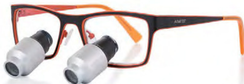
4.0x | JAZZ

Admetec Prismatic loupes are ideal for surgeons who require higher magnification for critical surgical procedures.