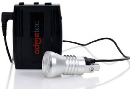
ORCHID / ORCHID-E BRIGHTER. LIGHTER. ERGONOMIC.