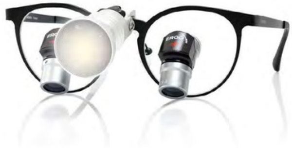
ORCHID-S / ORCHID ERGO

The ORCHID light is the first of its kind in the global market. It is remarkable for being lightweight while still providing a well-focused and shadow-free light.