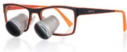
2.5x | JAZZ

High quality Galilean binoculars installed into the loupes are extremely close to the eye and therefore provide a wide field of vision.