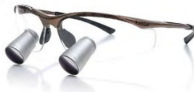
3.2x | BOLLE